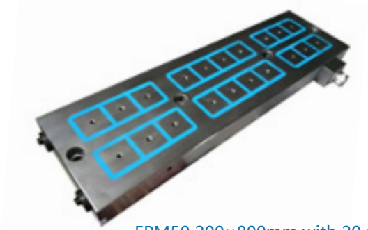
EPM50 200x800mm with 20 poles.